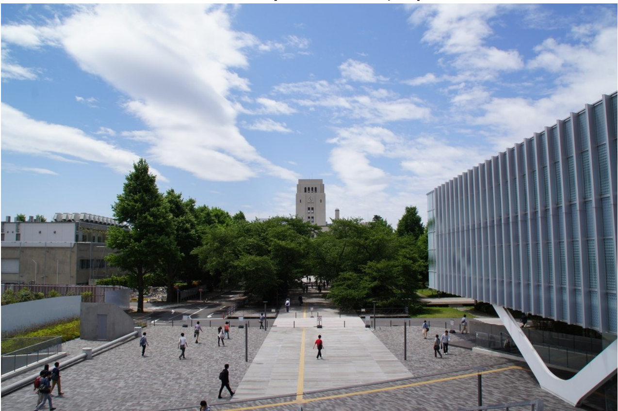
Main Building & Library, Ookayama Campus, Tokyo