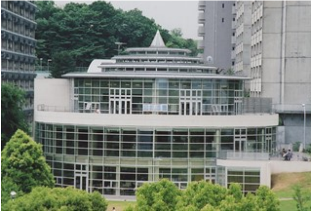
Suzukakedai Campus, Yokohama