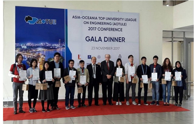
AOTULE Conference 2017

Hanoi University of Science and Technology