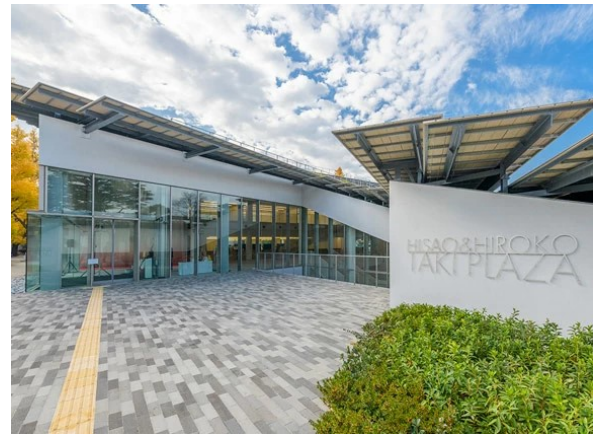
Taki Plaza, Ookayama