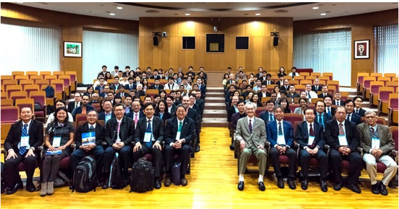
AOTULE Conference, November 2019, Ookayama Campus, Tokyo

The Asia-Oceania Top University League on Engineering (AOTULE), founded in 2007, is a league of 13 premier engineering universities within Asia-Oceania region. The AOTULE promotes inter-university cooperation through joint programs including an annual Dean's meeting, student workshop and exchanges of students and staff, in order to improve the quality of engineering education and research of the members. It aims to broaden participating students' perspectives through education, research and cross-cultural interactions (excerpts from AOTULE website).