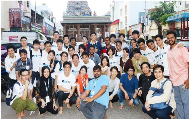
AOTULE Conference 2018