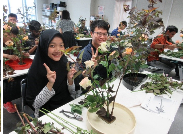
Japanese Culture Experience